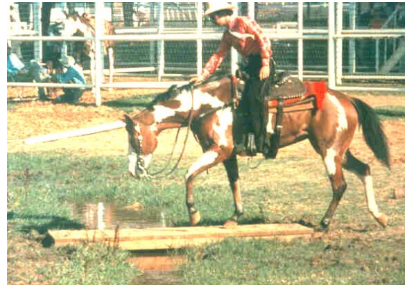
Figure 1. The visual world of the horse may be quite different from that of humans.

We have a tendency to anthropomorphize (attribute human qualities to our animals) when we think about the senses of animals. Therefore, it's natural to assume that the visual world of the horse is very much like our own. In fact, it may be quite different. Although the basic features of the equine eye are like those of most mammals, they differ in their details and that influences the way that they see. Here we summarize some of the major aspects of equine vision. A more detailed account of both vision and hearing in horses can be found in a review article by Brian Timney and Todd Macuda (2001).