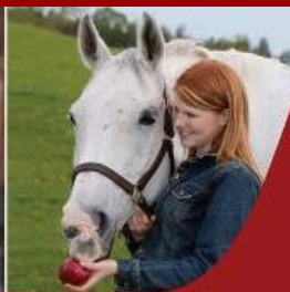
promoting health & performance