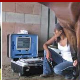
funding industry research