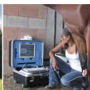
funding industry research