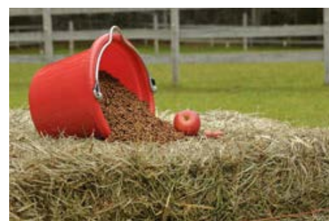
Feed good quality feedstuff.