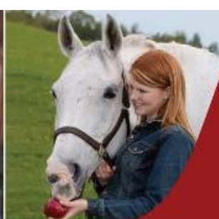
promoting health &amp; performance