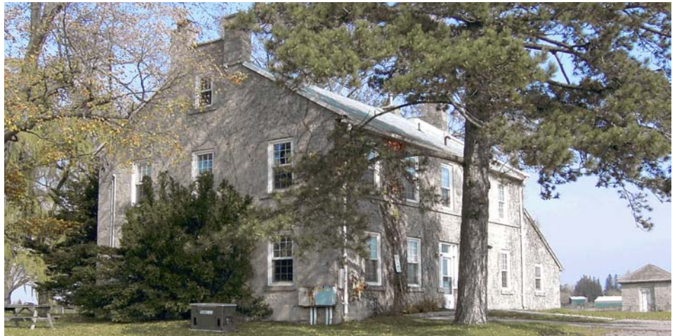
Proposed site of the Ontario Equine Centre will protect both historically and environmentally sensitive property.

The site is ideal for many reasons. It is one of the few remaining 600-acre tracts in this part of Ontario. Its topography is ideal with much of the site flat and hence suitable for building facilities including training tracks, with the balance being higher rolling land thus supporting equine activities such as three-day eventing. In addition, the site is historically significant, as it was the home of one of the early settlers in the area. Lastly, the site is environmentally important because the Arkell aquifer – the source of drinking water for the 100,000 residents in the City of Guelph – lies beneath it. The OEC would protect these important lands from future urban sprawl and its functions are environmentally friendly. "Amazing!" exclaimed Canadian show jumping champion, Ian Millar, during a tour of the site. "When