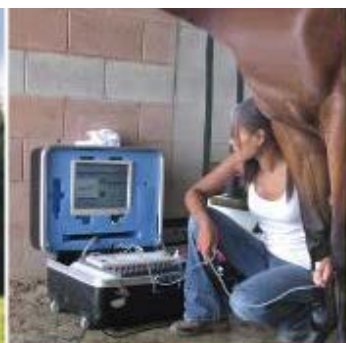
funding industry research