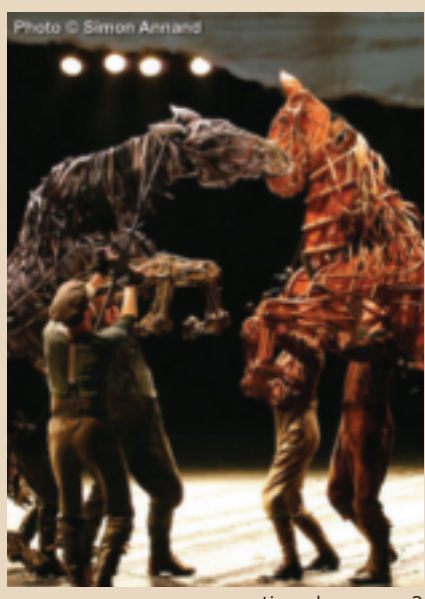
continued on page 2