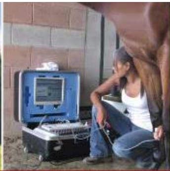
funding industry research